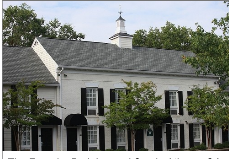
The Foundry Park Inn and Spa in Athens, GA

The conference will include innovative sessions, panels, and discussions targeted at concerned incident responders and transportation and public safety executives. A silent auction and Awards Banquet will occur on Monday evening.