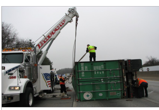
Responders at a TRIP incident

The I-95 Corridor Coalition's Traffic Incident Management Teams Best Practice Report can be found in its entirety here .