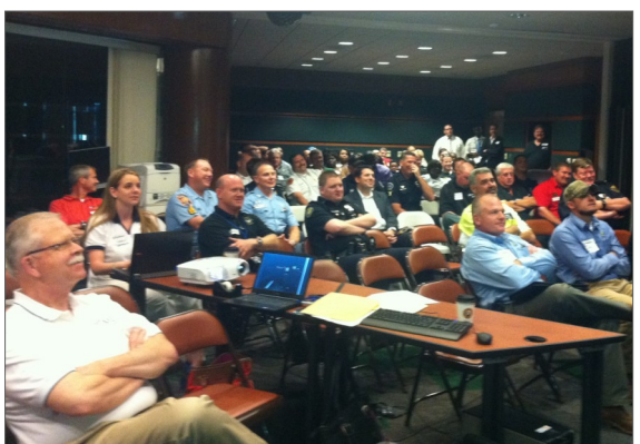
A Full House at the April Quarterly

For more information about this or any other previous TIME meeting, visit http://timtaskforce.com/archivemeeting.html .