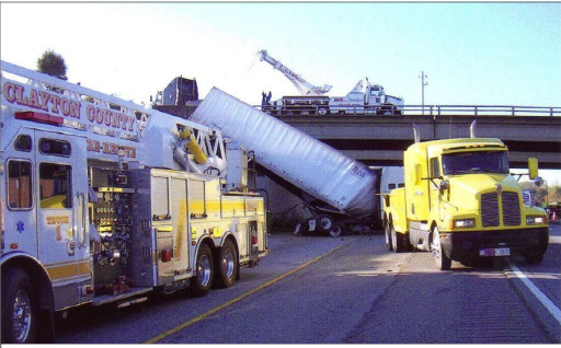
Sosebee's Tractor-Trailer Recovery

Sosebee's most challenging incident involved a loaded tractor-trailer that fell off the overpass at Forest Parkway onto I-75. The trailer was still caught on the bridge, but Sosebee's was up to the challenge of recovering it.